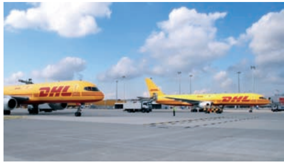
Magdeburg Port, East Germany's largest inland port DHL-air cargo hub at the Airport Leipzig/Halle